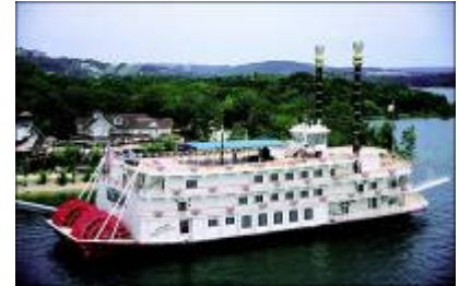
Top Notchers Cruise the Mississippi Wednesday, May 20th